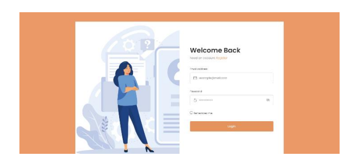
Fig 2. Login Page

Our Firebase cloud hosting and data storage platform is provided by Google. It is a suitable solution for both mobile and web application development. Firebase comes with its set of services such as real-time database, authentication, cloud functions, and hosting, making it a worthwhile choice for developing smaller applications or building and deploying serverless apps. Whereas setting up is the backend part, developers will set up firebase projects, define data providers, authentication, and firebase real-time database. In addition, the Firebase Cloud Functions is the choice for implementing the server-side logic, including invoking alarms and working user's requests, thus giving the full-page communication between backend and frontend.